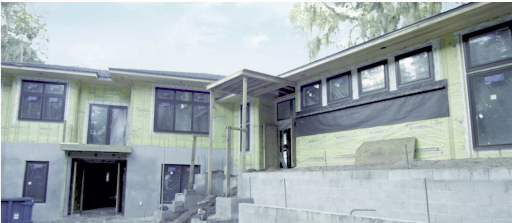
Not only was ccSPF insulation installed in Ty's home for its energy efficiency, it can help the structure withstand severe coastal weather while providing comfort inside.