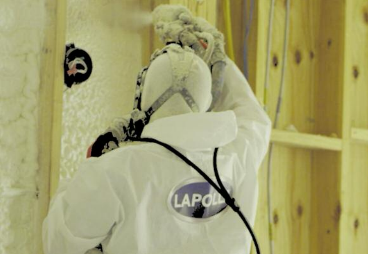
The applicator wore proper protective equipment and followed safety procedures throughout the installation.