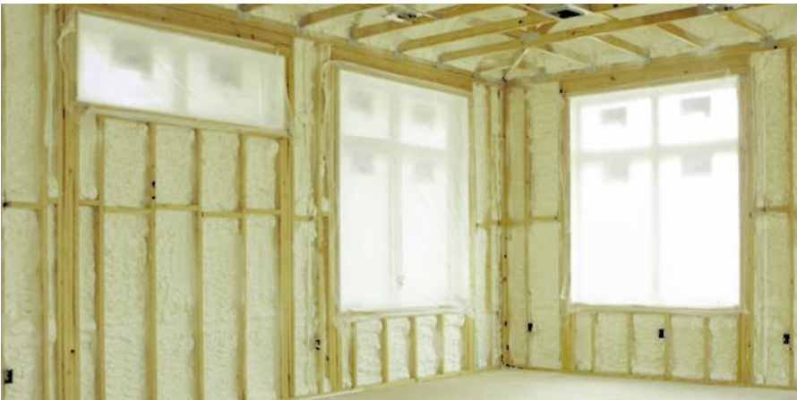
Lapolla's new ccSPF insulation formulated with Solstice LBA performed flawlessly throughout the installation.